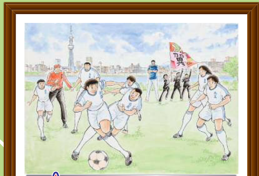
1 Arakawa River Bed

"Captain TSUBASA and Katsushika City" Original author Takahashi Yoichi of "Captain TSUBASA" is from Yotsugi in Katsushika City. The name of the fictional town of Shizuoka Prefecture named Nankatsu City, which is the setting of the work, was named from "Tokyo Minami-Katsushika Senior High School (Katsushika City Tateishi)" where Takahashi sensei graduate. "Captain TSUBASA" is playing an active role as a regional symbol as a place of connection for the author and work!!