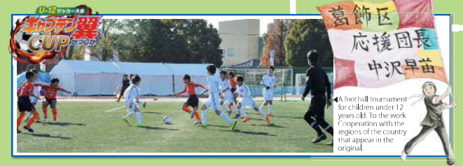
A football tournament for children under 12 years old. To the work Cooperation with the regions of the country that appear in the original.