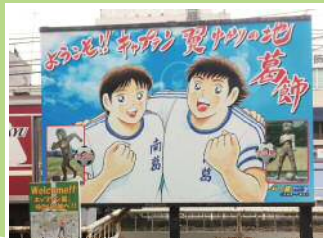
At Tateishi Station, a signboard that is the land of connection is welcome!