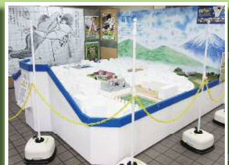
Faithfully reproduce the scene in the diorama of "Nankatsu City"